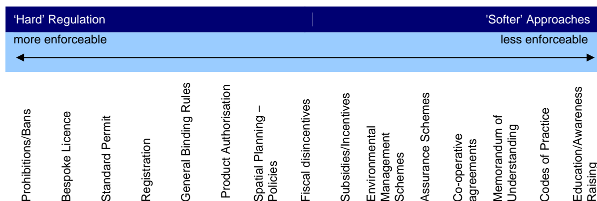
Figure F.1: Types of approaches for mechanisms

These mechanisms are already used to apply many of the so-called 'basic' measures to protect waters and the dependent ecology. These measures have helped achieve greatly improved standards, and represent a considerable amount of activity and investment. They need to continue in order to prevent deterioration.